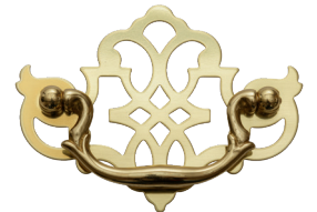
#87 Polished Brass Chippendale Pull