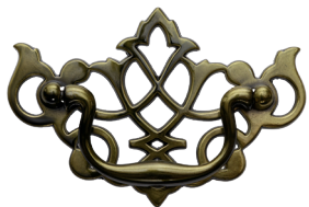
#85 Antique Chippendale Pull