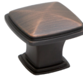
Milan 1 Knob 1091-DBAC 1 3 / 16 " Square Available in AB, AEM, BNBDL, DACM, DBAC, PC, SN