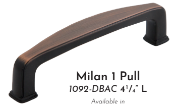
Milan 1 Pull 1092-DBAC 4 1 / 4 " L Available in AB, AEM, BNBDL, DACM, DBAC, PC, SN