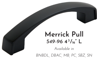
Merrick Pull 549-96 4 3 / 16 " L Available in BNBDL, DBAC, MB, PC, SBZ, SN