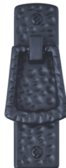
#24 Hammered Mission Door Pull