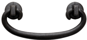
#27 Black Iron Rustic Bail Pull