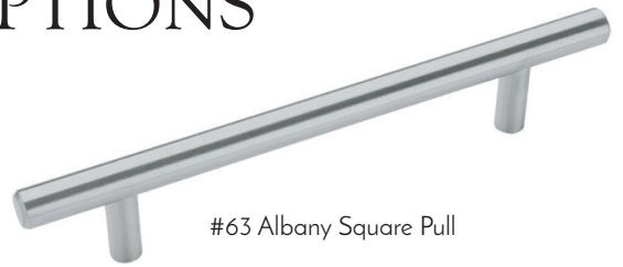
#63 Albany Square Pull