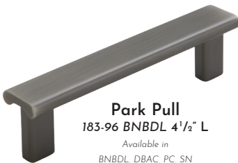
Park Pull 183-96 BNBDL 4 1 / 2 " L Available in BNBDL, DBAC, PC, SN