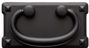
#21 Mission Pull