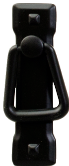
#22 Mission Door Pull