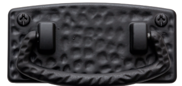
#23 Hammered Mission Pull