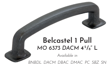
Belcastel 1 Pull MO 6373 DACM 4 5 / 8 " L Available in BNBDL, DACM, DBAC, DMAC, PC, SBZ, SN