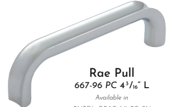
Rae Pull 667-96 PC 4 3 / 16 " L Available in BNBDL, DBAC, NI, PC, SN