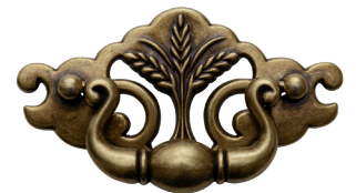
#81 Wheat Pull