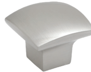
Sonoma Knob 431 SN 1 3 / 16 " Square Available in BNBDL, DBAC, MB, PC, SN