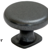
Belcastel 1 Knob MO-6303 DACM 1 3 / 8 " Diameter Available in BNBDL, DACM, DBAC, DMAC, PC, SBZ, SN