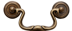
#83 Antique Brass Bail Pull