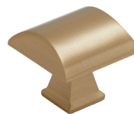
Roman Knob 944 SBZ 1 1 / 4 " L Available in BNBDL, DBAC, MB, NI, PC, SBZ, SN