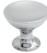
Rae Knob 667L PC 1 3 / 16 " Diameter Available in BNBDL, DBAC, NI, PC, SN