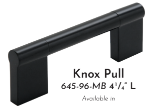
Knox Pull 645-96-MB 4 1 / 4 " L Available in MB, PC, SN