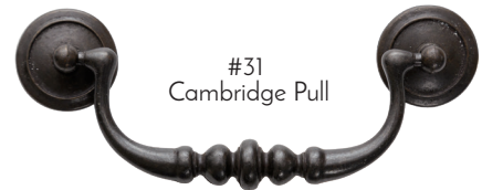
#31 Cambridge Pull