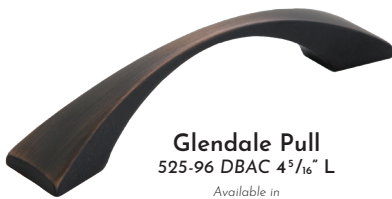
Glendale Pull 525-96 DBAC 4 5 / 16 " L Available in BNBDL, DBAC, DMAC, MB, PC, SIM, SBZ, SN