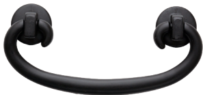
#25 Black Rustic Bail Pull