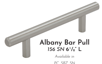
Albany Bar Pull 156 SN 6 1 / 8 " L Available in PC, SBZ, SN