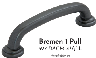
Bremen 1 Pull 527 DACM 4 5 / 8 " L Available in BNBDL, DACM, DBAC, DMAC, MB, PC, SBZ, SN