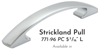
Strickland Pull 771-96 PC 5 3 / 16 " L Available in BNBDL, DBAC, PC, SN