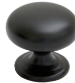
Florence Knob 2980 - MB 1 1 / 4 " Diameter Available in BNBDL, DBAC, MB, ORB, PC, SBZ, SN