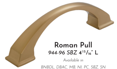
Roman Pull 944-96 SBZ 4 15 / 16 " L Available in BNBDL, DBAC, MB, NI, PC, SBZ, SN