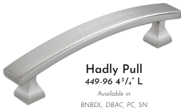
Hadly Pull 449-96 4 3 / 4 " L Available in BNBDL, DBAC, PC, SN